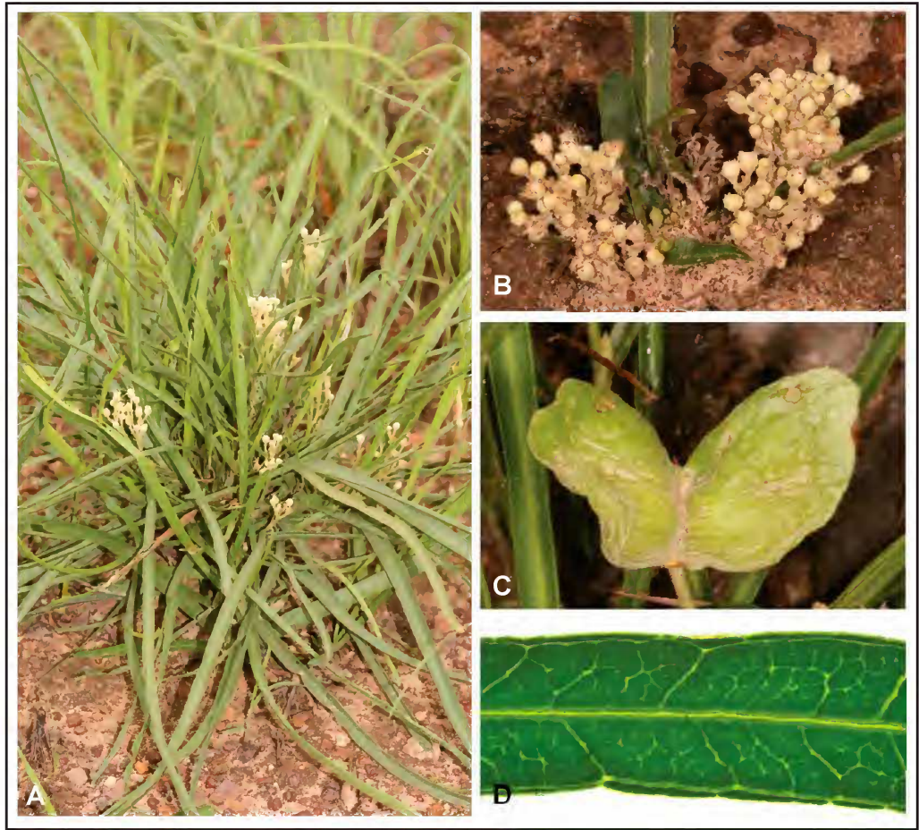
Figure 1. Atalaya brevialata . A – habit; B – inflorescence emerging from the ground with young leaves; C – fruit showing two samaras (the left-hand one damaged); D – mid-section of leaf lamina showing venation. (I.D. Cowie 12865).

5638. Atalaya angustifolia is often suffruticose, but has compound leaves and different flowers.